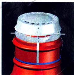
Strap Fixing Model

Fix 150mm straps to base of cowl (at four points) on the outside of the cowl using butterfly screws. Ensure the hook end of straps are pointing outwards from the pot. Tighten jubilee around straps and chimney pot. Ensure the cowl is secure